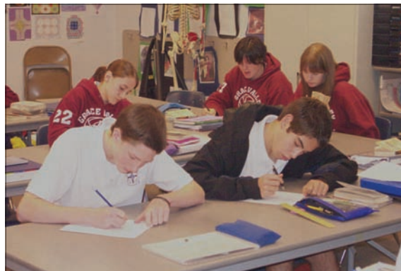
9th Grade Health Class Lecture

Grace Valley Christian Academy uses the nationally recognized Core Knowledge Sequence as the foundation of its curriculum. The Sequence is a detailed outline of specific content in language arts, history, geography, mathematics, science and the fine arts. Much more than a list of facts to be memorized, the Sequence provides a solid foundation on which to build the skill and content necessary for lifelong learning. Because it serves as a guide to coherent and specific content from grade to grade, the Core Knowledge Sequence encourages steady academic